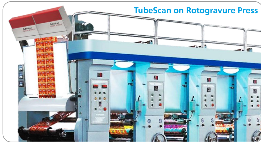
TubeScan on Rotogravure Press

Presenting TubeScan Digital , for your wide web (up to 1100 mm) applications which provides considerably higher process reliability with the base function. This system can be installed on any Press during the printing stage or on a Doctoring Machine to detect defects.