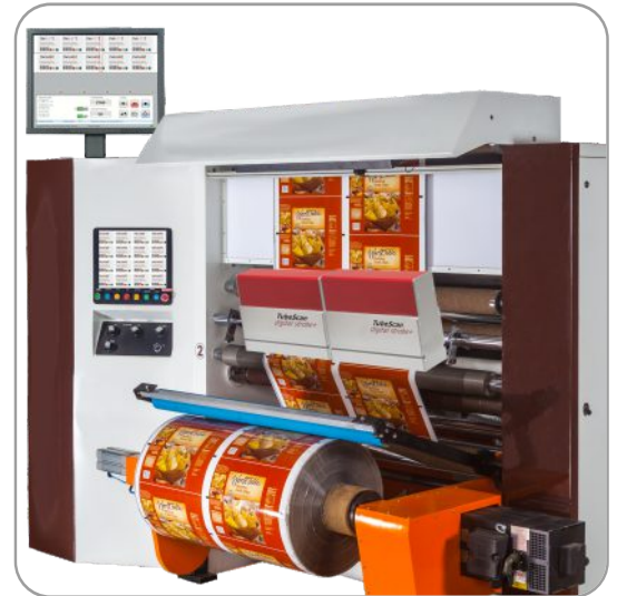
TubeScan on Doctoring Machine