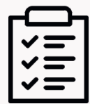
Job / Roll Reporting