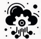
Industry 4.0 Ready